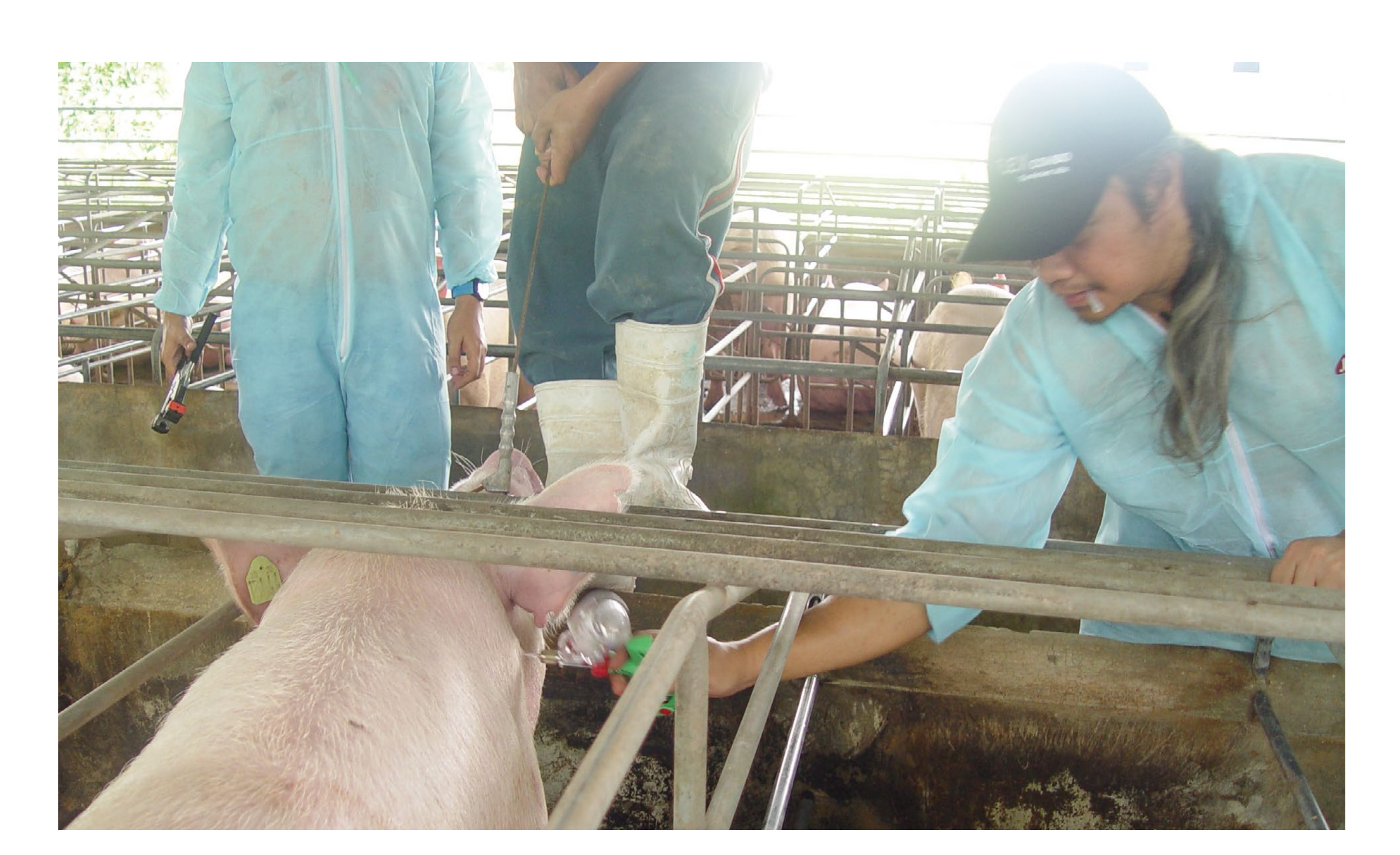
Picture 1: Intramuscular vaccination of the PED Modified Live Vaccine

The modified live vaccine used in this study proved to be efficacious in reducing the clinical impact of a PED infection. Vaccination of sows is beneficial with regard to pre-weaning mortality and weaning weight of the litter. Successful control of PED needs to include appropriate biosecurity measures, cleaning and disinfection and movement restrictions. Further studies are under way to confirm the efficacy of Enterisol PED MLV under different conditions. Meanwhile, PED remains a challenge for the SE Asian pig industry.